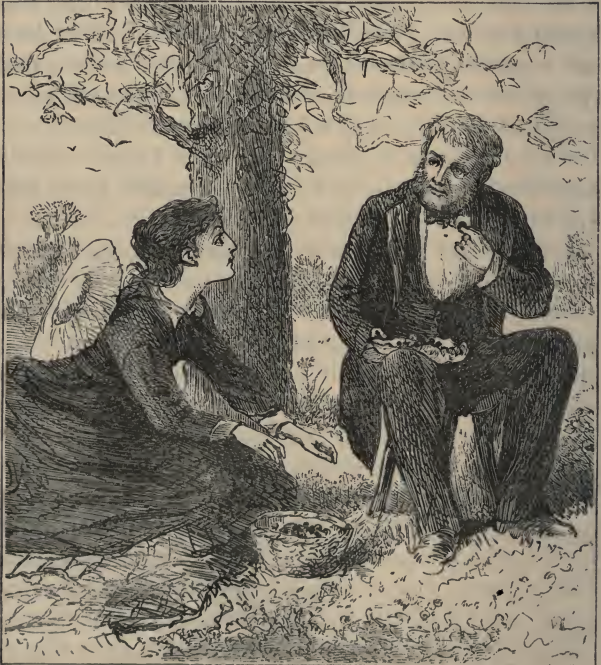
MR. POWER AND CHRISTIE IN THE STRAWBERRY BED.

“This is luxury!” and Mr. Power sat down on the three-legged stool offered him, with a rhubarb leaf on his knee which Christie kept supplying with delicious mouthfuls.